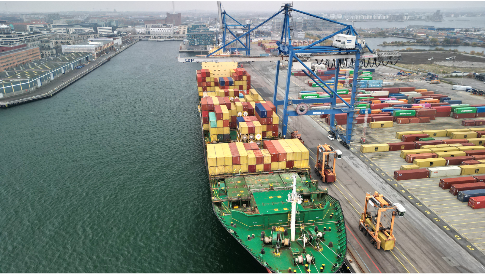
Copenhagen Malmö Port's container terminal in Copenhagen